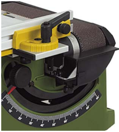
Support table for contact sanding.