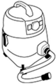
Vacuum cleaner adapter to keep your work area cleaner. We recommend the use of our compact workshop vacuum cleaner CW-matic.