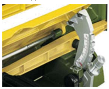
Table angle adjustment possible from -5° to 50°. With large dimensioned serrations at 0°, 10°, 20°, 30° and 45°. Additional fine adjustment for precise mitre and angle cuts.