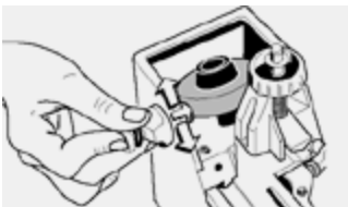
Dressing the stone.

Operating the Drill sharpener BSG 220 is quite simple. Also untrained users will be able to re-sharpen spiral drills according to DIN. In order to obtain satisfactory results though, it is important to study the product manual attentively before working with this machine. Starting without reading these relevant instructions, one will not be able to achieve the expected precision.