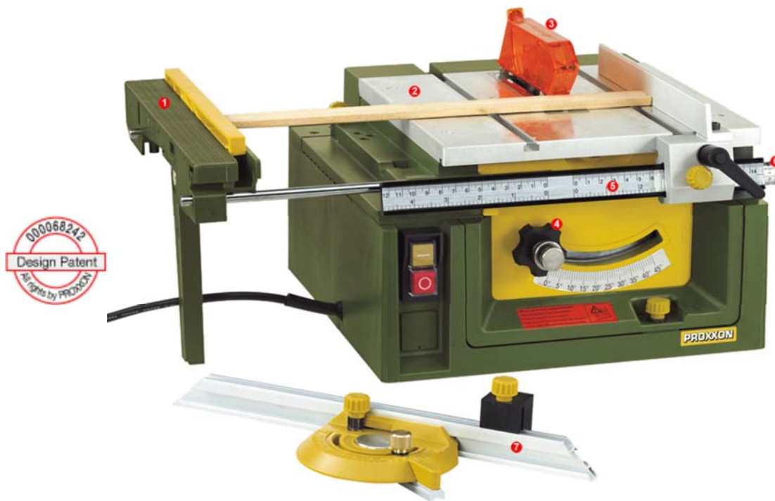
Table saw FET

For precise, straight cuts without refinishing! With micro-adjustable longitudinal stop.