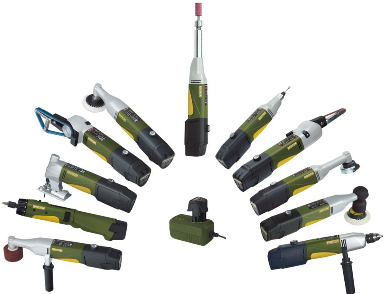
Eleven power tools - one system!