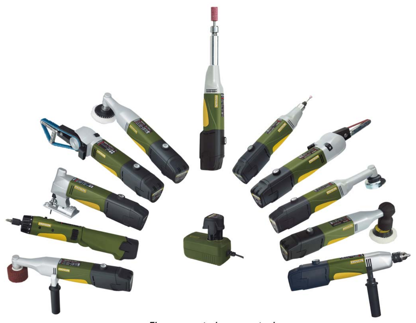
Eleven power tools - one system!

One battery and one rapid charger only for now already eleven professional tools: