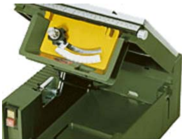
Table and drive can be lifted up and supported like an engine bonnet. For cleaning the device and easy saw blade replacement.

Non-slotted sawing cap cover of ABS for tight tolerances between saw blade and table (is slotted from below by the FET saw blade). For cutting very small parts.